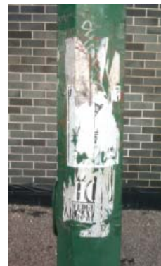
Damage After Removal