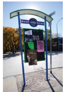
West End Bulletin Board