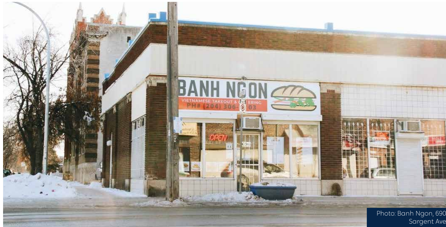
Photo: Banh Ngon, 690 Sargent Ave

This spring, the BIZ partnered with Spence Neighbourhood Association and Central Neighbourhood Association for two community clean-ups. With everyone's help and support, we are able to get the neighbourhood ready for summer!