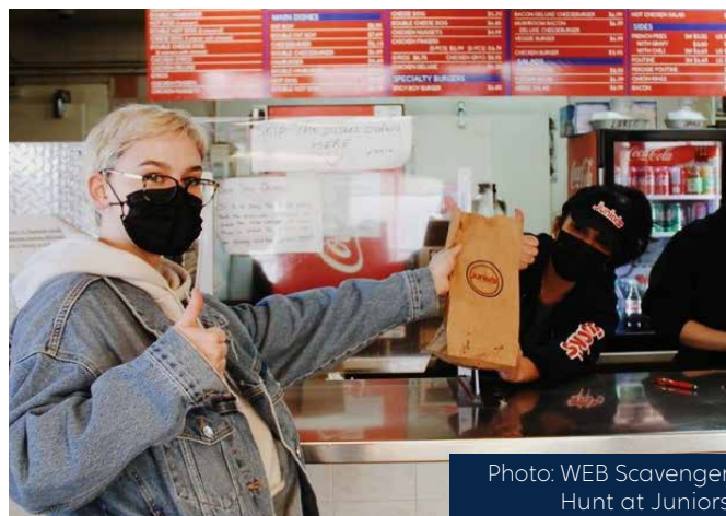
Photo: WEB Scavenger Hunt at Juniors