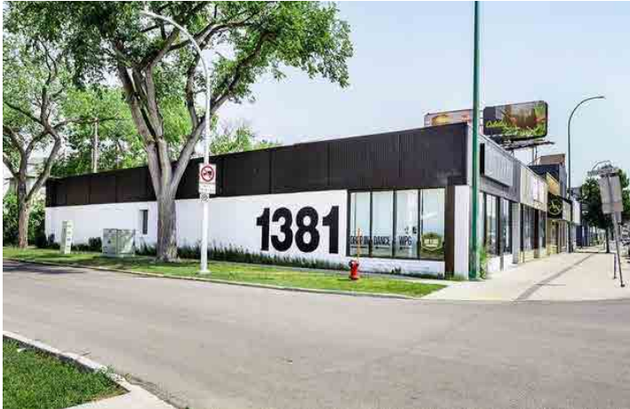
Drop in Dance, 1381 Portage Ave

If you are not sure if a project qualifies for a grant or rebate, just send us an email at info@westendbiz.ca .