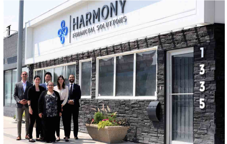
Harmony Financial Solutions, 1335 Portage Ave